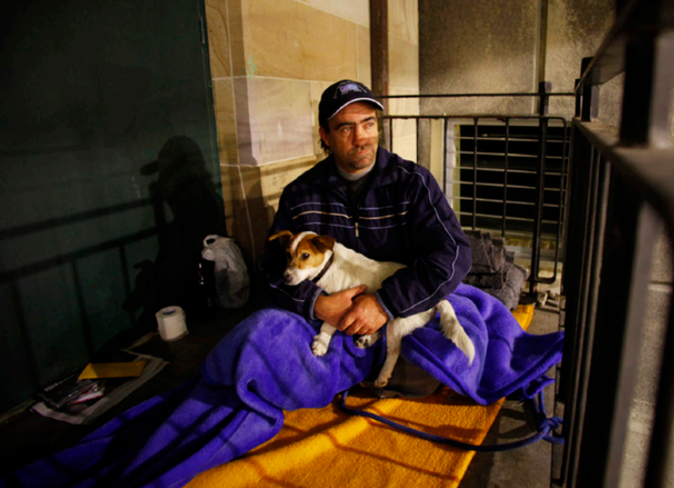
An interviewee during the 50 Lives 50 Homes Registry week.